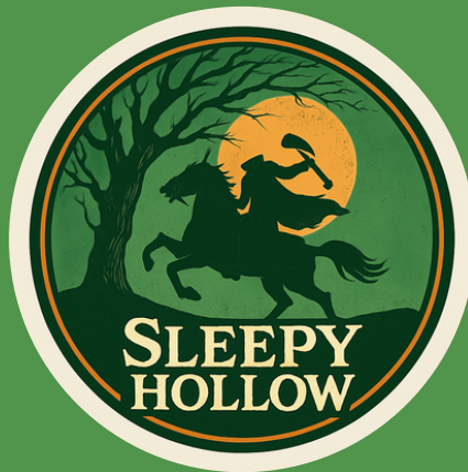
SLEEPY HOLLOW based on the short story by Washington Irving