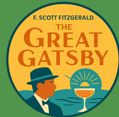
THE GREAT GATSBY based on the novella by F. Scott Fitzgerald