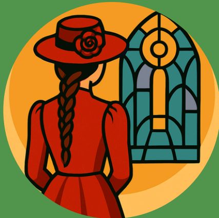
DRACULA based on Bram Stoker's classic