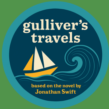
GULLIVER'S TRAVELS based on the novel by Jonathan Swift