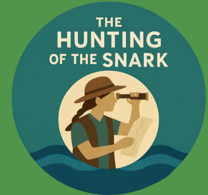
THE HUNTING OF THE SNARK inspired by the poem by Lewis Carroll