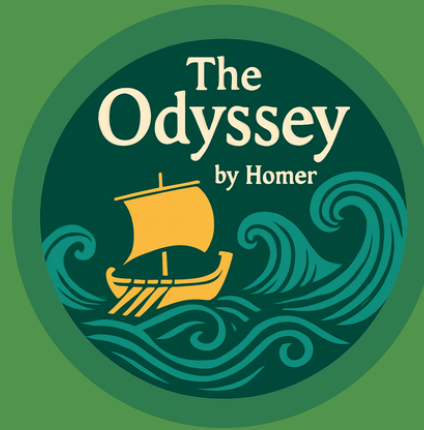
THE ODYSSEY based on Homer's Greek epic